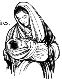
Mary's Little Boy Child Was born on Christmas Day.